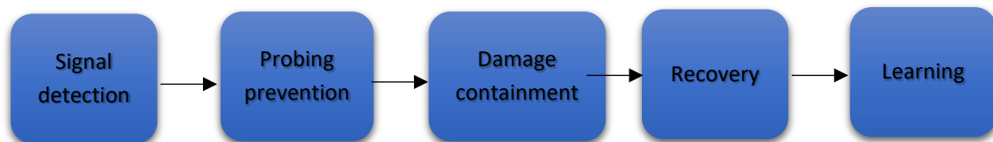
Figure: 1 Five-stages model of crisis management (Mitroff, 1994).

As illustrated in the diagram above, Mitroff's crisis management paradigm is divided into five stages: (1) signal detection; (2) probing and prevention; (3) damage containment; (4) recovery, (5) learning. Mitroff's crisis has an edge significance over another crisis management model. The first two stages (e.g., signal detection, probing and prevention), cover the proactive efforts that an organization can take prior to a crisis event.