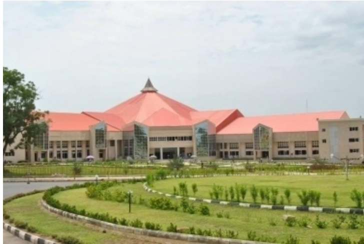
Figure 4: This is the Faith Tabernacle, a 50,000 seat church auditorium, reported to be the largest church auditorium in the world by the Guinness Book of Records.

In the business world we are taught that borrowing is allowed provided it is for profit making. That is great and there's nothing wrong with that.