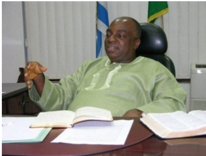
Figure 2: David Oyedepo. "If you don't want to lose your place in the race, pay attention to reading"

“Give your attention to reading if you don’t want your youth to be despised... If you don’t want to lose your place in the race, pay attention to reading. ”