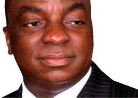
Figure 1: Bishop David Oyedepo

If you are reading this book, chances are that you know Bishop David Oyedepo, or that you have heard about him in the public domain.